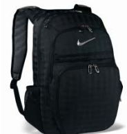
Departure Backpack (Style#TG0126-001)