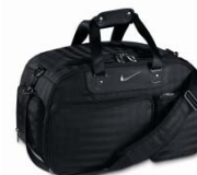
Sm. Departure Duffle (Style#TG0127-001)