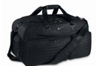
Lg. Departure Duffle (Style#TG0128-001)