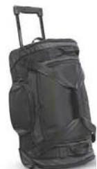
Little Big Wheel