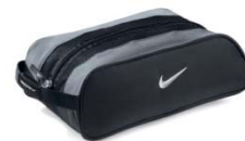
Club Shoe Tote (Style#TG0066-001)